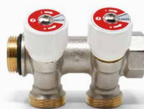
Manifold with 2 outlets