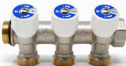
Manifold with 3 outlets

☑ 3/4" E outlet ☑ Outlets center distance: 40 mm